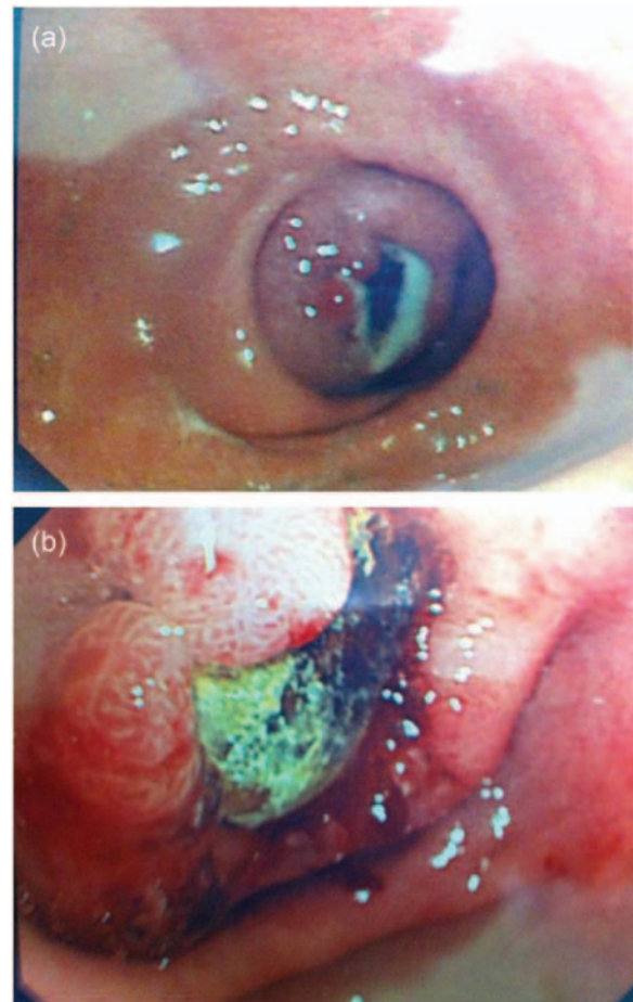
Figure 2: (a and b) Endoscopic visualization of fistula and gallstone.

Biliary fistulas occur in 3–5% of patients with gallstones [1], with the duodenum being the most common site of fistulation followed by the stomach [2]. The risk with fistulation is subsequent obstruction of the gastrointestinal tract which, interestingly, is reported to occur most commonly in the terminal