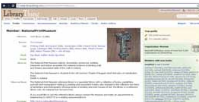
Figure 3. Profile home page

Profile home page: Each LibraryThing member has a profile home page. Here the museum entered information about and contact details for the library (See figure 3). The profile page also acts as a portal into the catalogue through the embedded search box.