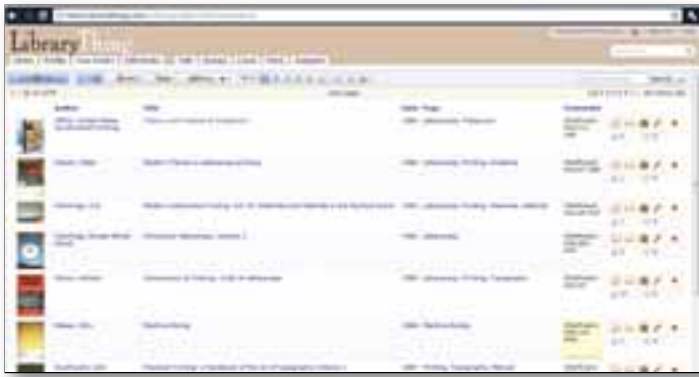
Figure 2. List view and classification

The museum encountered some difficulty adding the classification of the book to the book record. LibraryThing only provides fields for Dewey or Library of Congress classification. However, the Print Museum uses an internal classification scheme. A workaround solution was found by adding the classification of each book to the comments field, preceding the classification number with “Shelfmark:” (figure 2)