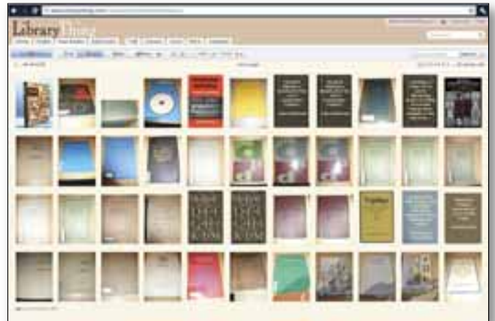
Figure 4. Cover view

There is the option of displaying other fields such as ‘ISBN’, ‘Rating’, and ‘Dewey Decimal Classification’ as well as many others. On the right hand side of the page there are links to social networking information, such as user reviews and other users who share the same book and also to editing options. Other views include the ‘cover view’ (figure 4) and the ‘tag view’ (figure 5). Libraries can set a preferred viewing style and layout and visitors to the catalogue are encouraged to use this through a pop up which appears when they access the catalogue.