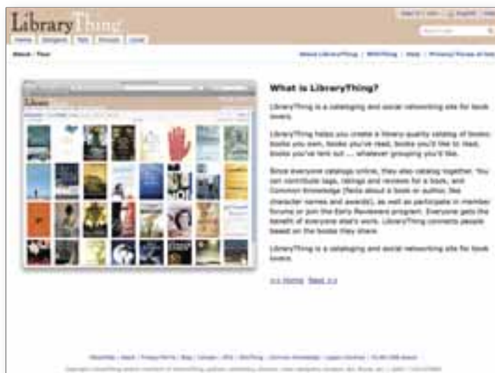
Figure 1. LibraryThing

LibraryThing is a web-based, low cost, user friendly social networking cataloguing tool that enables development of a library's assets as well as providing an online platform for sharing other libraries' collections. It was created by web developer Tim Spalding in 2006 and as of December 2011 had 1.4 million users and over 50 million individual books catalogued into its system (LibraryThing.com 2011). LibraryThing offers excellent value for money; the museum purchased a lifetime organizational account, with a limit of 5,000 books, for just $25. LibraryThing is also extremely user friendly as it was originally designed with personal users in mind (Ishizuka 2006).